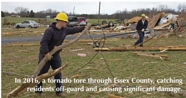
In 2016, a tornado tore through Essex County, catching residents off-guard and causing significant damage.

As we mark National Disaster Preparedness Month in September, now is the perfect time to get ready for a predicted - or an unexpected - disaster.